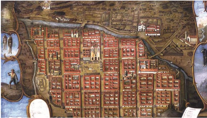
Figure 1: El Cerco de La Paz de 1781 Florentino Olivares, 1888

(137-138), I contend Saenz produces a non-human territoriality following the mobility of the Choqueyapu. As the river streams, the Andean walker transits in company of powerful nonhuman beings, juxtaposing social and ontological spheres, encompassing the worlds of Paceños, mountains, and rivers.