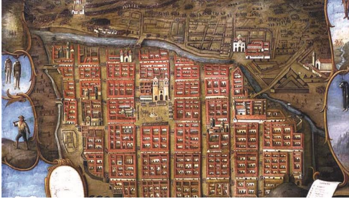
Figure 1: El Cerco de La Paz de 1781 Florentino Olivares, 1888

(137-138), I contend Saenz produces a non-human territoriality following the mobility of the Choqueyapu. As the river streams, the Andean walker transits in company of powerful nonhuman beings, juxtaposing social and ontological spheres, encompassing the worlds of Paceños, mountains, and rivers.