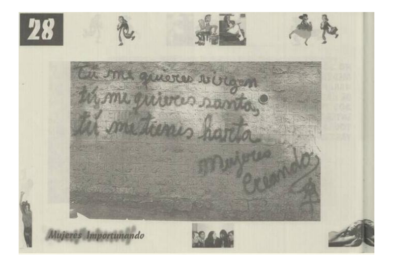
Figure 2. Source: Paredes 1999, 28

Mujeres Creando transposes Storni's poetry to the external wall of a public restroom: "Tú me quieres virgen, tú me quieres santa, tú me tienes harta," providing an amusing and fresh look at her aesthetic (Fig. 2).